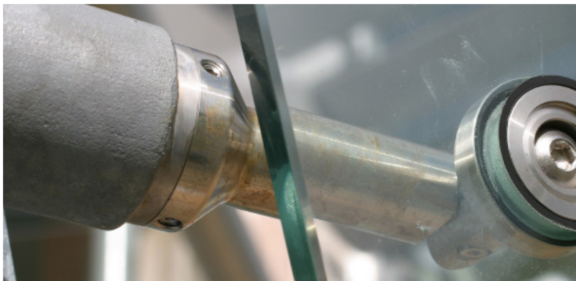
Stainless steel in direct electrical contact with galvanized steel which may result in bimetallic corrosion