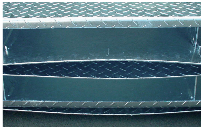
Fig 2. Distortion of thin section checker plate

There is always some potential for an article to distort during the hot dip galvanizing process. However, by taking suitable precautions it is normally possible to prevent distortion from occurring in the vast majority of cases.